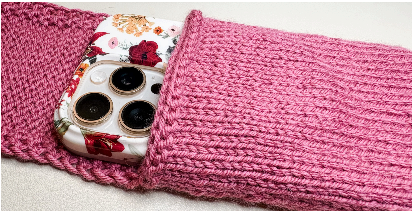
Promenade Pouch by Jessica Ays • Double the Stitches

Bind off 20 sts, leaving 20 sts remaining.