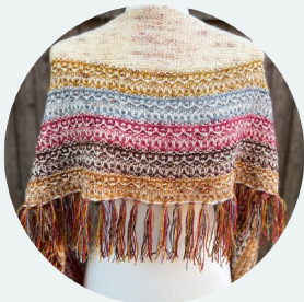
Color Crush Shawl